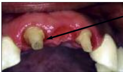
Teeth cut down to pegs for a bridge

Partial dentures have clasps that hook onto adjacent teeth, putting pressure on them as the partial rocks back and forth. Eventually these teeth can loosen and come out as a result of this pressure.