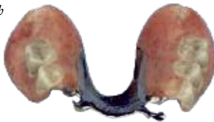
Partial denture which hooks onto natural teeth

Replacing missing teeth with implant supported crowns/bridges does not involve the adjacent natural teeth, so they are not compromised, or damaged.